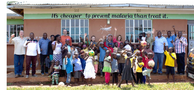
Busia Compassionate Centre 2018

The Busia Compassionate Centre in Kenya is home to 65 children, ages three to twenty-one, many of whom have lost their parents to HIV/AIDS. In February 2012, American Heritage formed a committee of employees to support and sponsor fundraisers to benefit the orphanage. To date, over $20,000 has been donated to the orphanage.