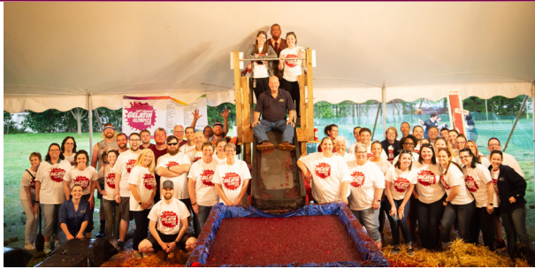
Gelatin Olympics 2019